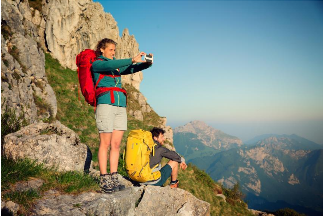
Thule Versant – a lightweight and versatile hiking backpack that is customizable for a perfect fit.

A selection of product launches during the period