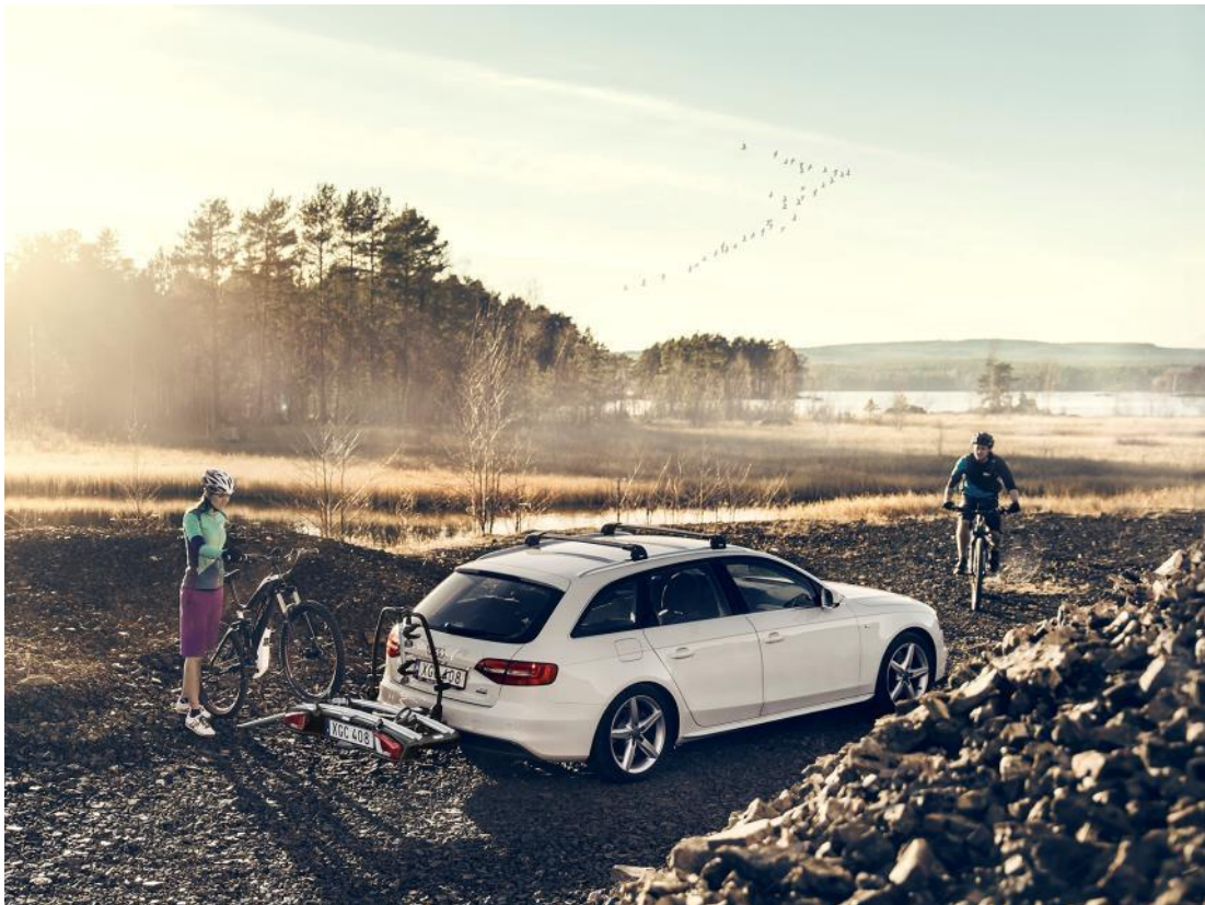
Thule VeloSpace – the ideal bike carrier for heavy mountain bikes or e-bikes.